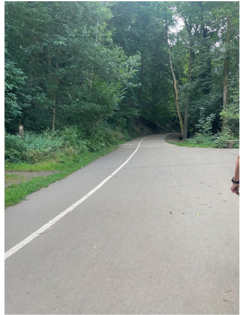
There is a level path to Shepherd Wheel Workshop from either end of Whiteley Woods.