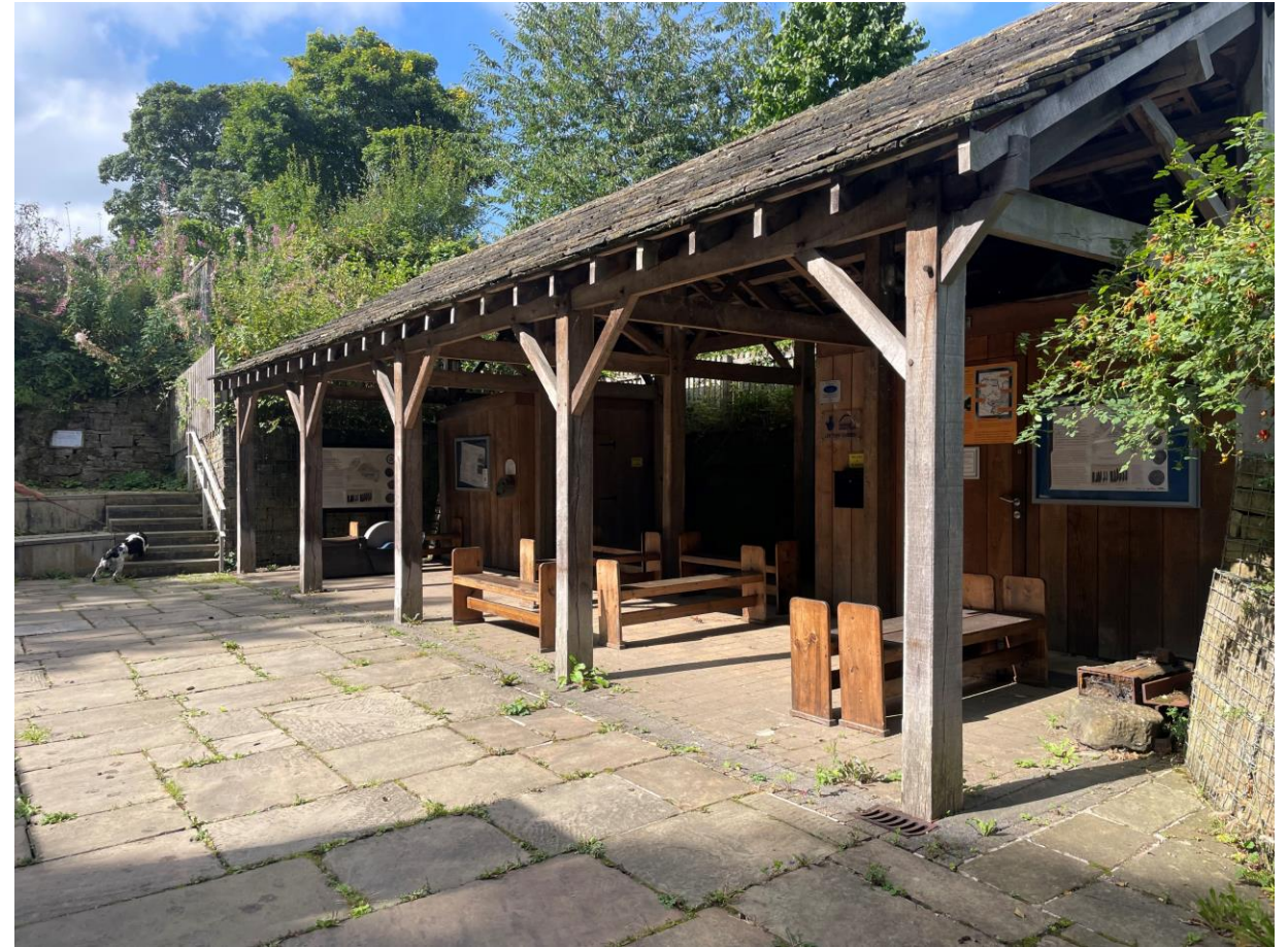
There is outdoor seating in the courtyard.