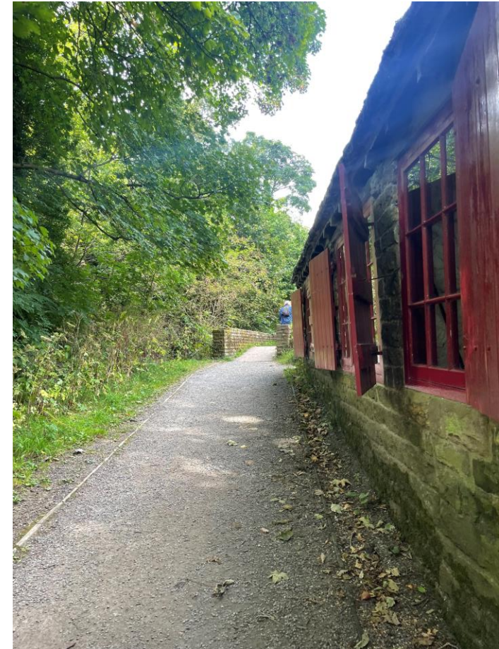
Next to Shepherd Wheel Workshop there is a dam which powers the waterwheel.